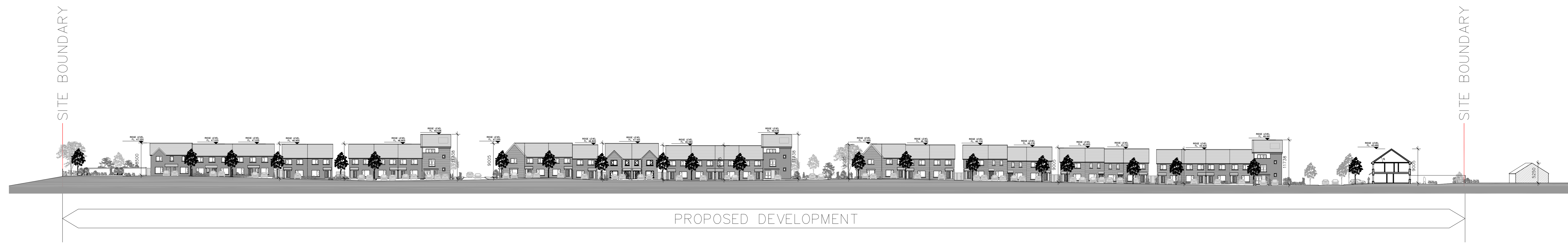
01 Proposed Site Section B-B PA 201 1:500